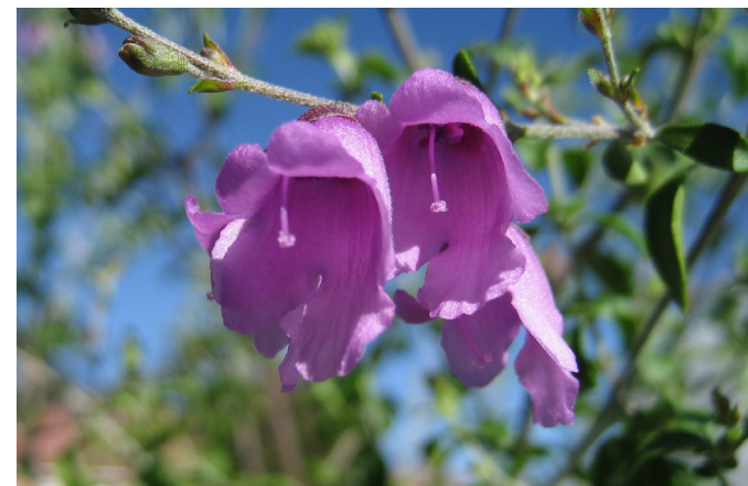
Purple Mint Bush Prostanthera ovalifolia - Grenfell form Unique to our region

We specialise in propagating plants of the Weddin Shire